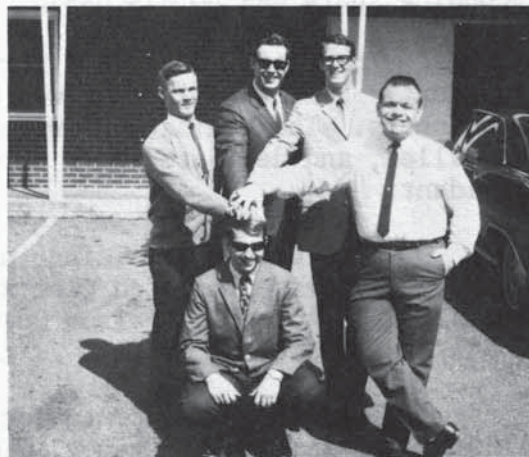
Pledge assumes the typical position of subservience.