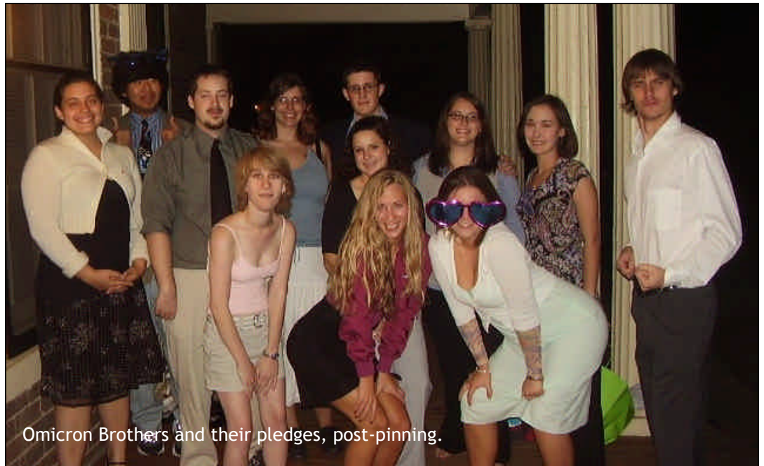
Omicron Brothers and their pledges, post-pinning.

in late March 2007. A committee has been formed and we've already started looking for bands, setting up advertising, and gathering prizes. We're hoping for an exciting time next semester and looking forward to having some fun and helping our community get more involved in arts and music. ♪