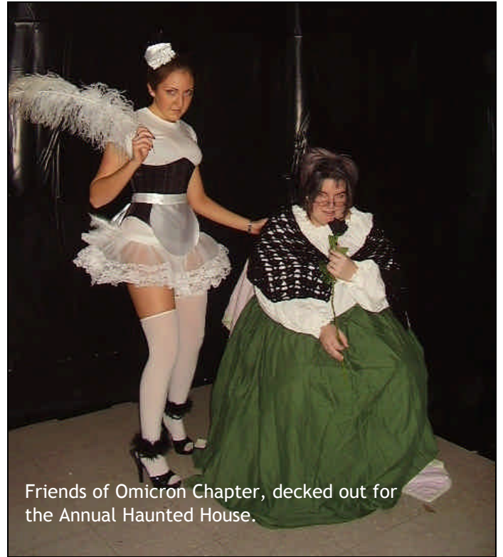
Friends of Omicron Chapter, decked out for the Annual Haunted House.

As for next semester, we've already begun planning for our second "Battle of the Bands" competition, to be held