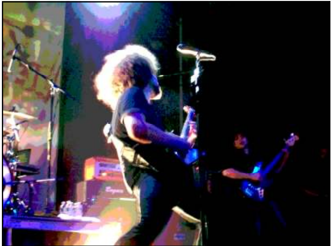
Coheed and Cambria lead singer, lead guitarist and creative genius, Claudio Sanchez, rips into a guitar solo with Michael Todd in the background during the concert in Syracuse.

But the second that Coheed & Cambria struck the first chord of "The Broken," the first single off their upcoming album Year of the Black Rainbow , the crowd was galvanized into the most enthusiastic enjoyment of music I've ever seen. They RUSHED to the front. We were thrust into immobility, pressed against the front railing by the electrified fans. Claudio Sanchez, lyricist, lead vocalist, and guitarist, lost himself in the music as his fingers obeyed the call of the rhythm in the anthemic opener. Travis Stever, guitarist and backing vocalist, smiled nearly the entire time, clearly loving the music he was playing.