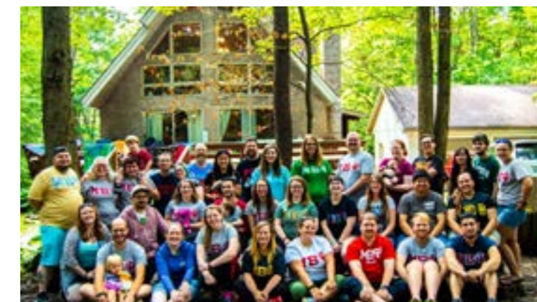
The Alumni Association at Mid-Year 2019