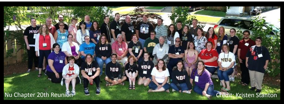
Nu Chapter 20th Reunion