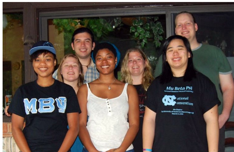
Mu Chapter Retreat