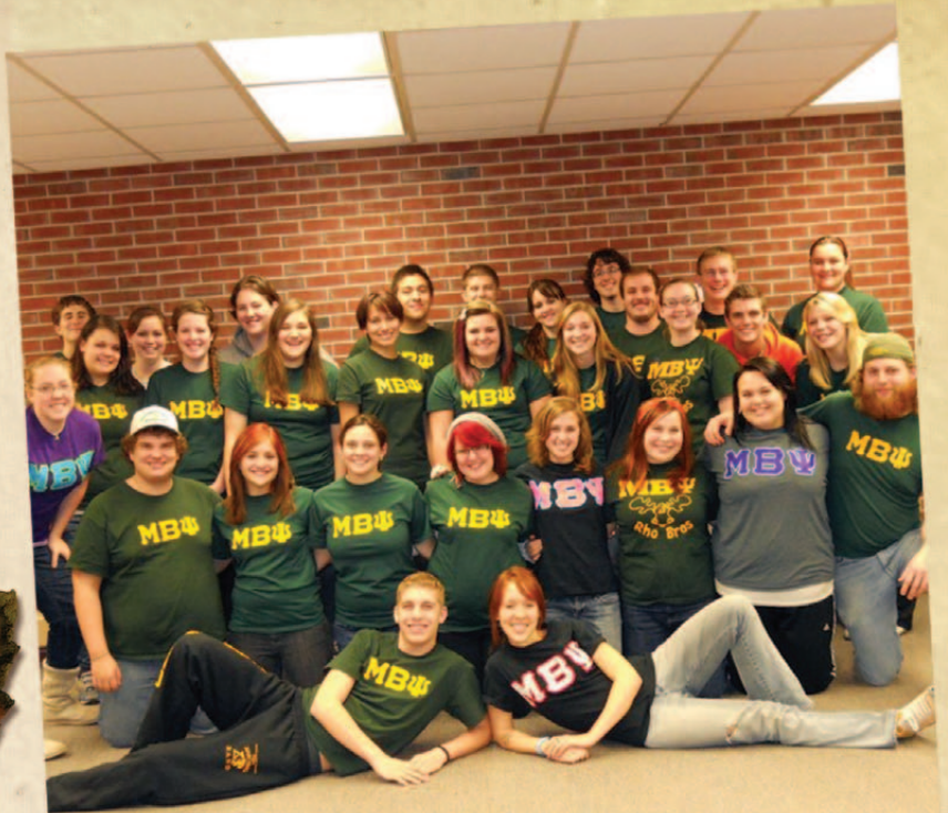
Rho Chapter (Northern Michigan University) becomes the Fraternity's largest Chapter, 3 years after its founding